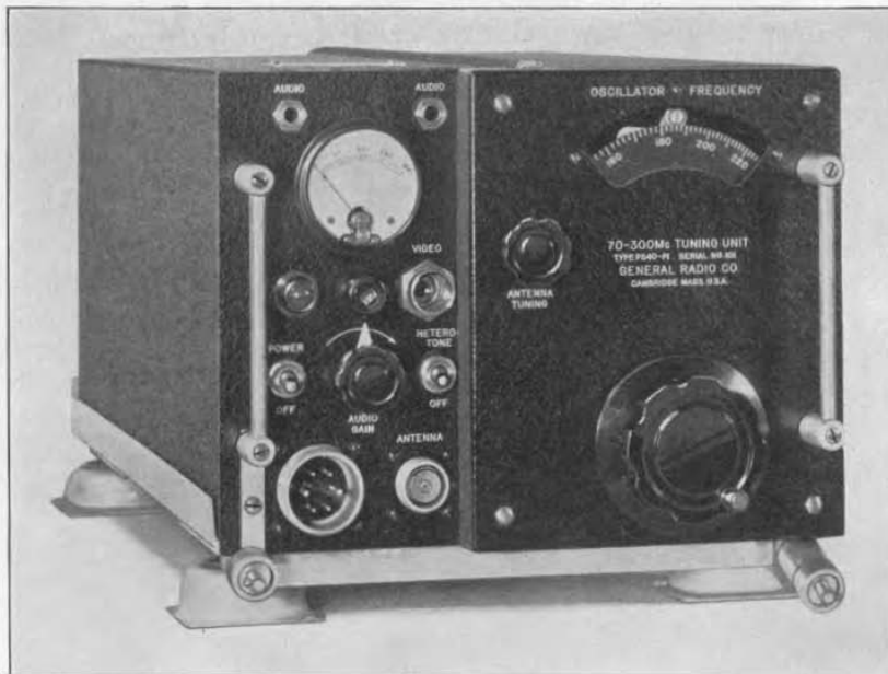
Figure 1. Panel view of the TYPE P-540 Receiver.