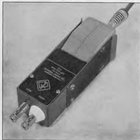
View of the TYPE 726-PI Multiplier attached to the Voltmeter probe.

This useful accessory is still available and a quantity has only recently been completed in our factory. Shipment can be made from stock.