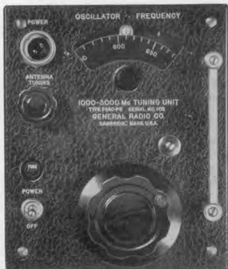
Figure 2. Panel view of the TYPE P-540-P3 Tuning Unit.

In conjunction with this work, the General Radio Company also developed a TYPE P540-P3 tuning unit to cover the